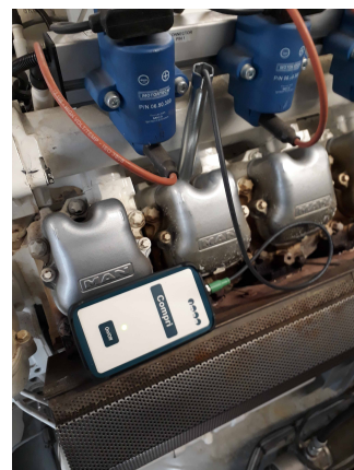
Compri installed on a power plant MAN E2842 Le312 4-stroke gas engine